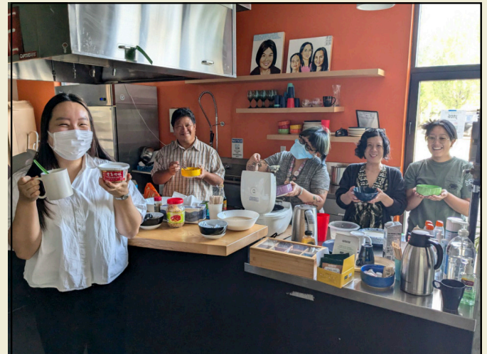
APANO volunteers making food and smiling

APANO runs more than 30 programs, from climate justice initiatives and small business coaching to the annual Jade International Night Market on August 29. The organization also offers yoga, martial arts, and monthly open studio space for BIPOC artists and makers. Every Wednesday morning its no-questions-asked Free Food Market provides culturally specific staples, fresh food, and community connection.