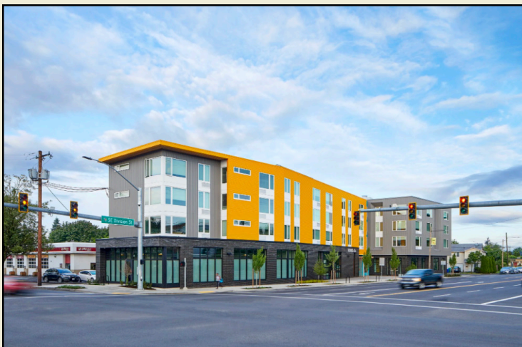
The yellow and gray APANO building on the corner of Division and Powell

Ever wonder about the big grey-orange-and-white building on the corner of SE Division and 82nd? It's home to APANO*, a social justice organization empowering Portland's Asian and Asian American communities since 1996. Opened in 2019, the welcoming space transformed a former furniture store through grassroots fundraising, community partnerships, and a GoFundMe campaign. Today it houses APANO's staff of 40, a community gathering space, and 48 units of affordable housing.