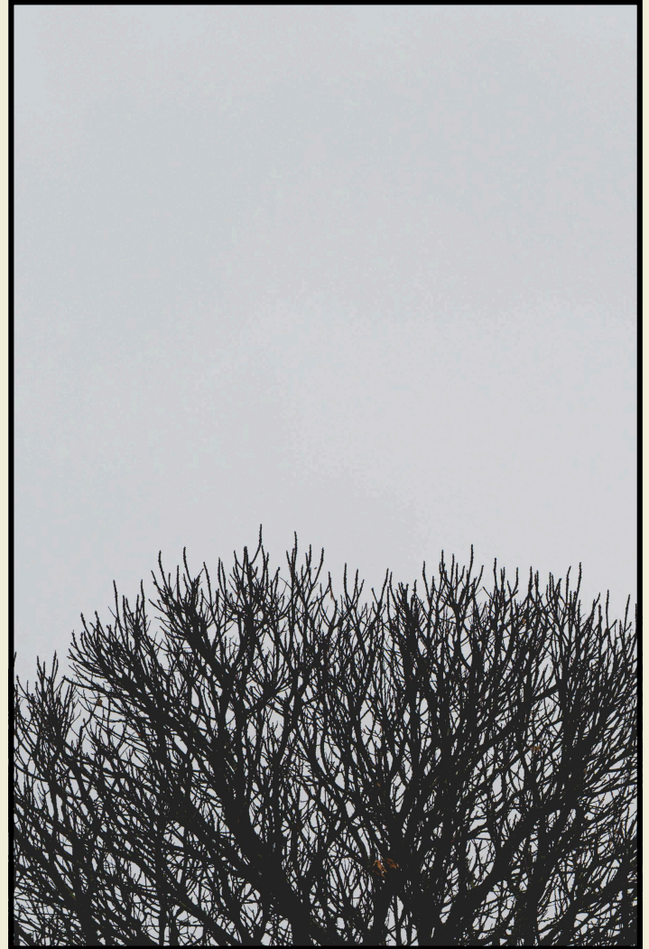
Wintertime in the Taborhood