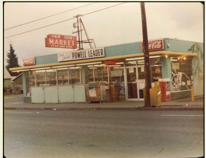
Sam & Jean's Market on Powell Blvd., 1946