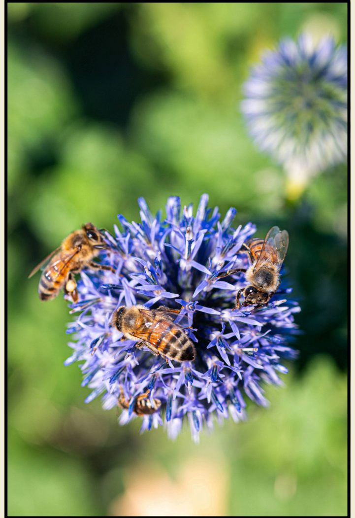
Bees on the hunt – summer is around the corner!