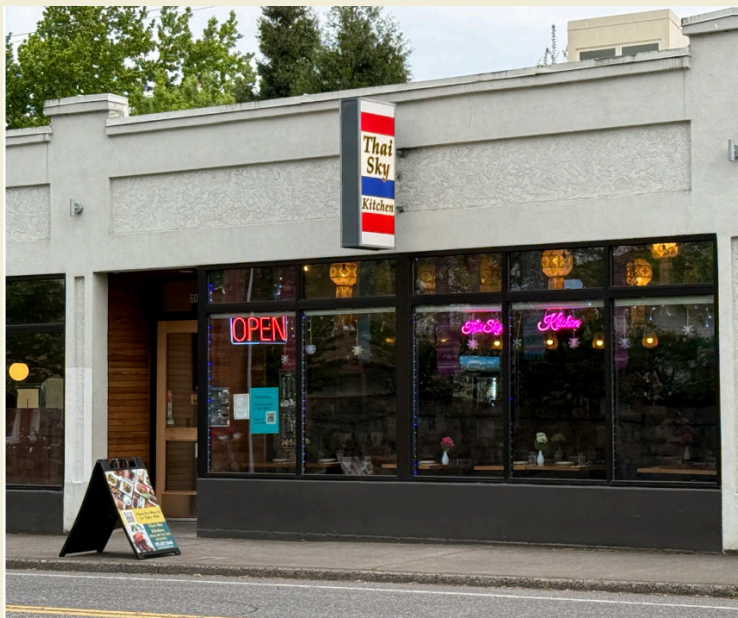
Thai Sky Kitchen @ 6036 SE Division St.

Thai Sky Kitchen is named for Jenny's love of everything airplanes and flying. She worked as a flight attendant and today lives near PDX. "Even as a girl in Bangkok, I'd go to watch the planes take off!"