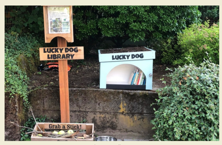
Lucky Dog Library

The library has expanded to include a registered Little Free Library with Portland's smallest dog park on top for our younger two-legged neighbors to play with.