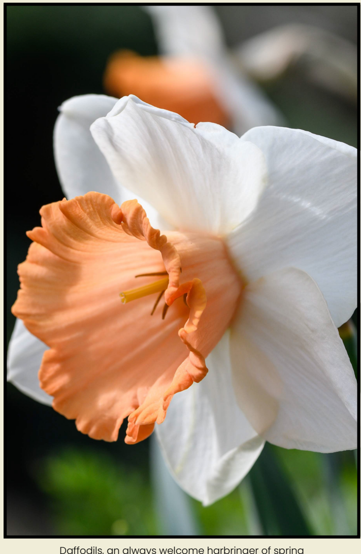
Daffodils, an always welcome harbringer of spring