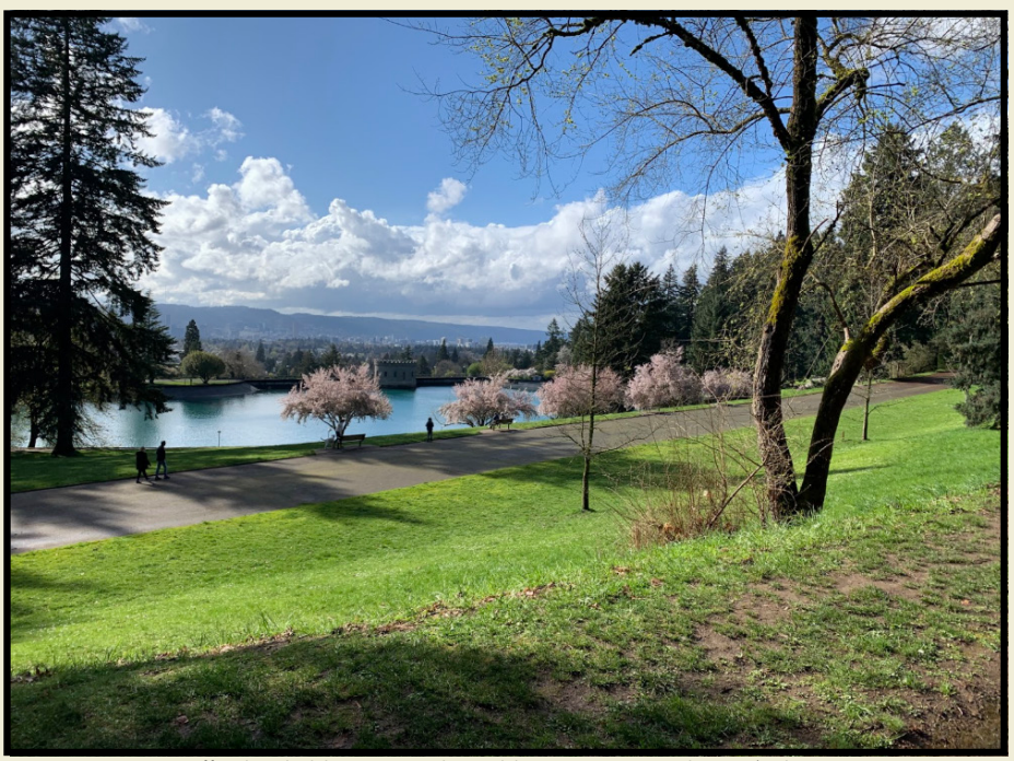
Puffy clouds, blue water, cherry blossoms – Mt. Tabor at its best!